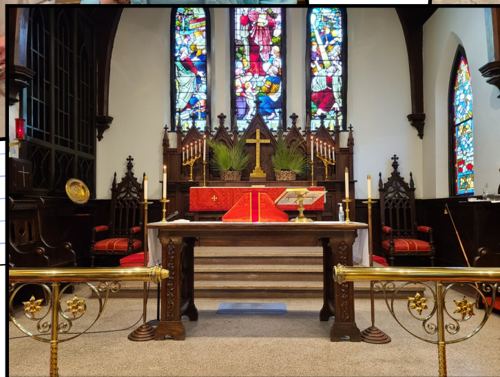
Always beautiful Holy Week Altar at St. Paul's.