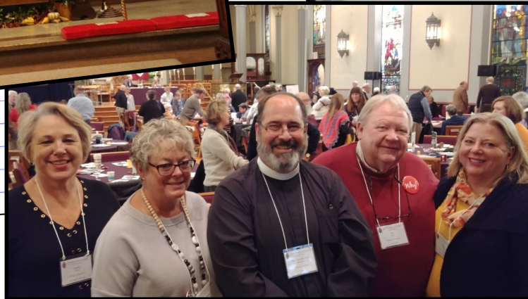
St. Paul's Parish was well represented at the 192nd Convention of the Diocese of Kentucky in Louisville.