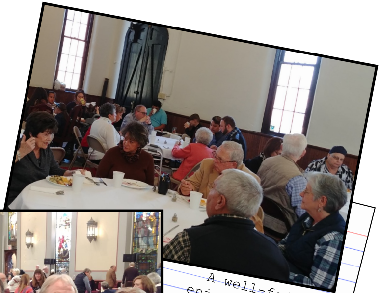
A well-fed crowd enjoyed the Parish Family Thanksgiving Feast the Sunday before the holiday!